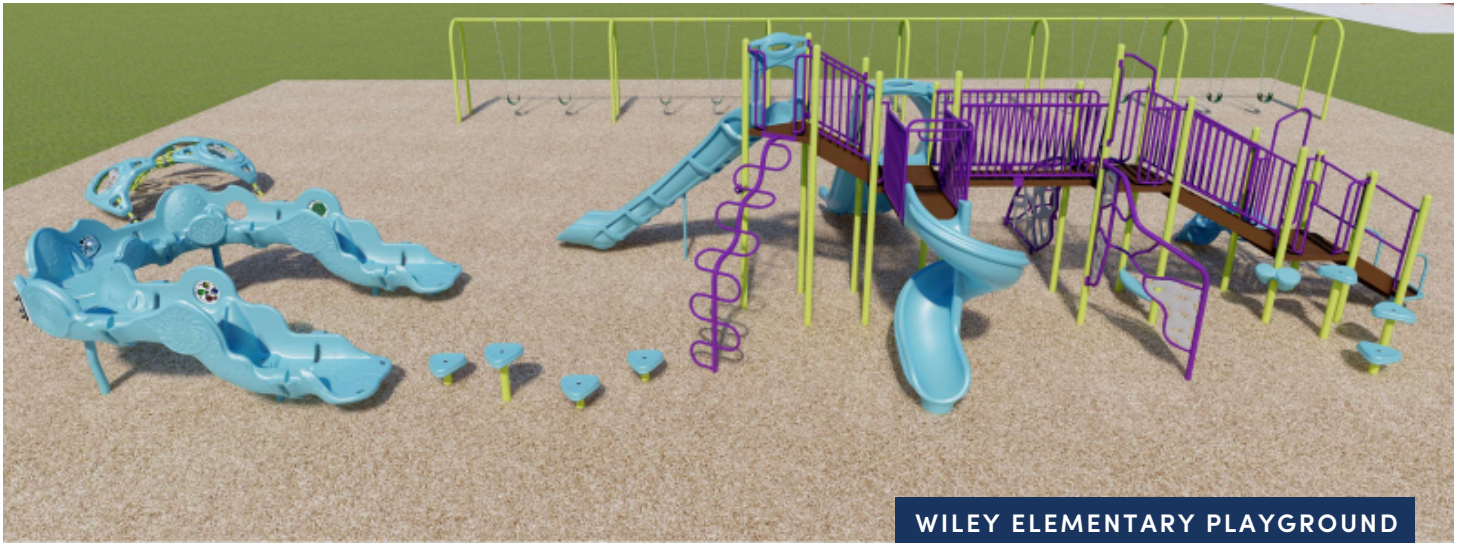
WILEY ELEMENTARY PLAYGROUND